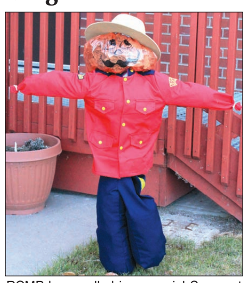
RCMP have called in a special Sergeant to deal with recent shenanigans.

"Have no fear, Sgt. Strawnald Lawman is on the case," say authorities, as the investigation into the Main Street purse nabbing continues.