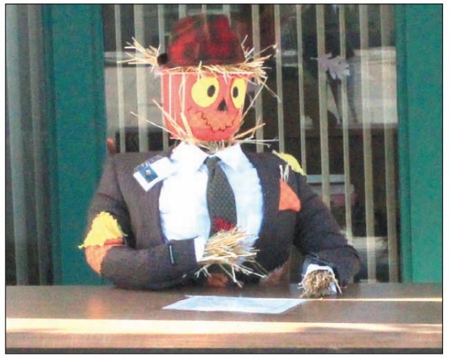
Authorities had their hands full when this fellow hit town full of mischief. He has set up shop right in front of the town office, and is claiming to be the new mayor of Killam.