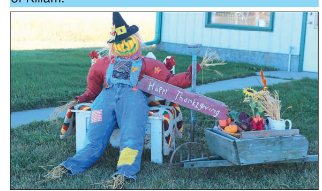
This party animal doesn't need an excuse to throw a party. He's reportedly having some trouble remembering where he left his hands and feet.