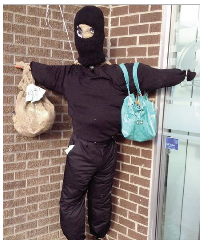
Eyewitnesses caught this Pernicious Perpetrator in the act as he attempted to win the heart of a fickle female by tempting her with stolen goods.