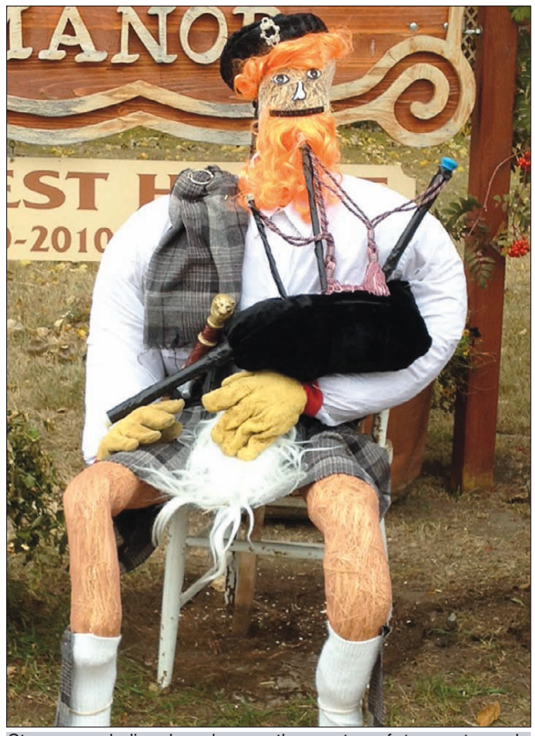
Strange melodies heard near the centre of town strangely reminiscent of fighting felines causing dogs to bark endlessly.

No end in sight as more and more new arrivals appear daily